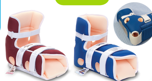
Heelift® Glide Heelift® AFO

Pictured with optional forefoot strap Use per clinician discretion